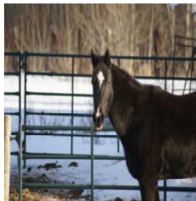
My horse has an attitude like mine(hehe)